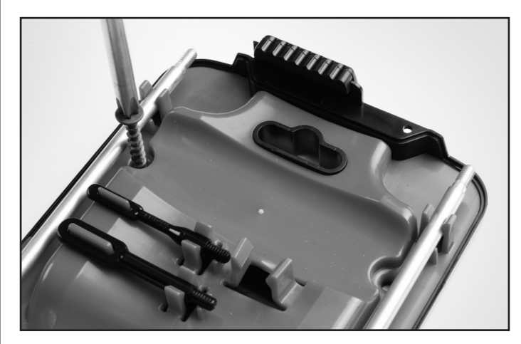
WALL MOUNT: Locate the two small holes behind the rod handle. These holes are sized to accept a standard drywall screw. This allows you to permanently mount case to a wall of your choosing.

TO FRIENDS AND CUSTOMERS: As the owners of Real Avid, authenticity isn't just a strategy here. It's a guiding philosophy. It arises out of our faith and personal relationships with Jesus Christ. We know that our creativity and success ultimately comes from Him. He cares about each of us and about our customers. We're not perfect, but we are committed to following Him in our personal and business lives.