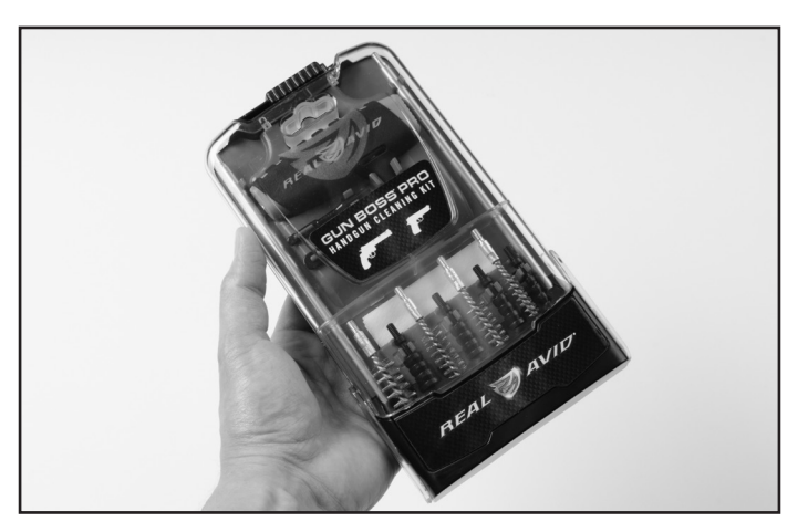
STOW AND GO: In this compact position the case stores virtually anywhere. Simply lock it shut and it is ready for your range bag, tool box, truck or ATV.

NO MATTER WHERE YOU CLEAN, THE GUN BOSS PRO HAS YOU COVERED.