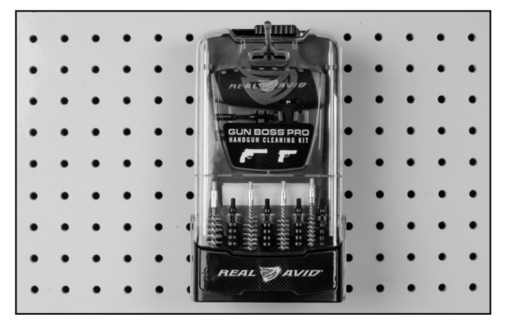
PEG BOARD: The convenient hole in the top of the case allows for easy storage on any peg board.