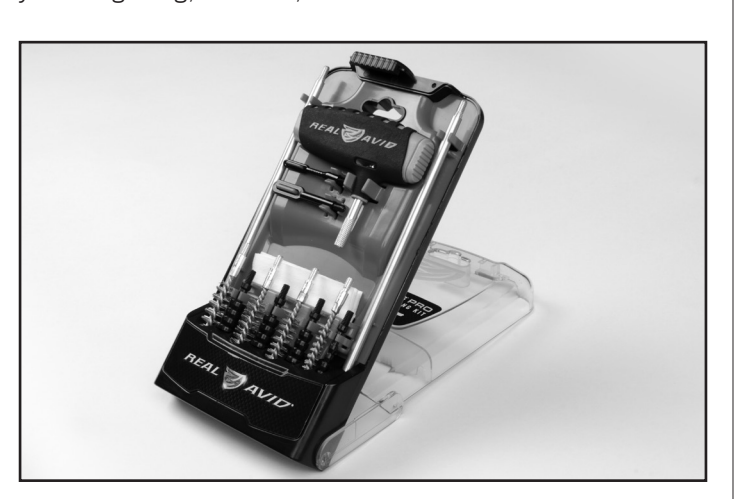
WORK BENCH: When opening the case, the clear cover rotates around to form a kickstand for the rest of the case. This allows for organized cleaning on any flat surface.